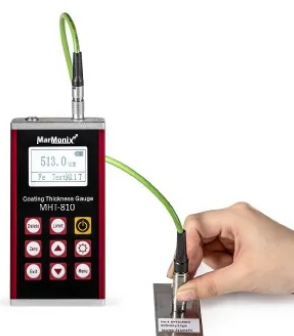
Measuring 513um specimen