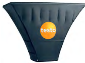
24" x 48"