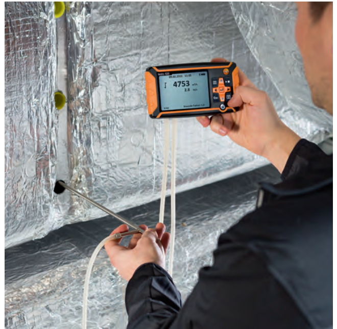
Detachable Differential Pressure (t420) instrument allows Pitot tube measurements in ducts (Pitot tube optional)