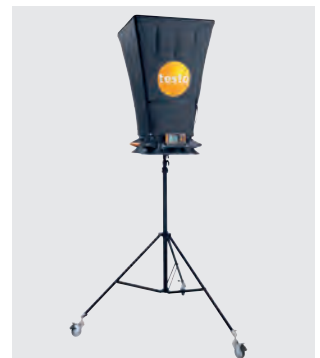
Sturdy, wheeled tripod (optional) with central fitting for safe measuring of high ceiling outlets.