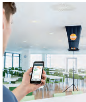
Bluetooth App allows for hands free operation, displaying measurement data on mobile devices and finalizing and sending the measurement report via email from the job site