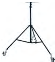
Tripod, extendable to 13'