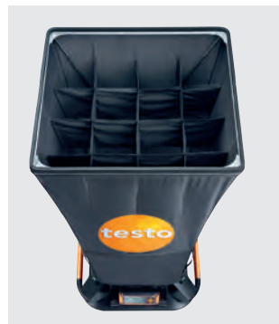
Flow straightener significantly improves accuracy of measurements at turbulent outlets.