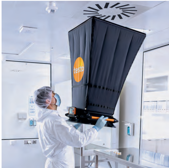
Precision measurements for critical applications