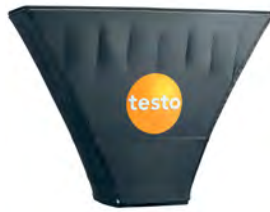
12" x 48"